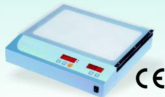
Cat. No. :MG-2131